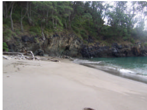
Opo (South East Bay) - Tuhua