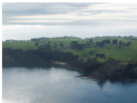
Western coast of Motiti

The idea behind doing that was that people felt uncomfortable with not knowing what the plan might contain or what kinds of activities it might provide for. It was considered that in this instance people would find it easier to review and provide feedback on a draft discussion document if necessary rather than to discuss the endless possibilities. Beca has now prepared a draft Environmental Management Plan (EMP) for Motiti, based on feedback received during the initial consultation. The plan has been distributed for comment.