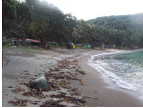
Opo (South East Bay) - Tuhua

Thank you for your input to date and we look forward to further meetings and discussion.