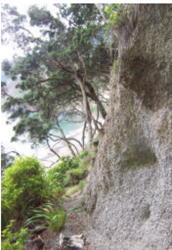
Looking towards Oira from track - Tuhua

It is proposed that a workshop hui will be held with the Tuhua owners to discuss the vision for the Tuhua EMP, covering such matters as how Opo (South East Bay) will be managed compared to the remainder of the island. The Tuhua owners will be advised of a date for the workshop hui in due course.