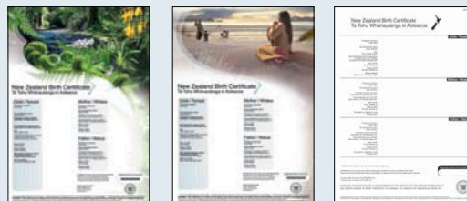
A certificate only B certificate only C certificate only