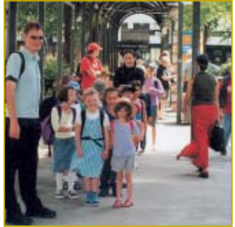
Picture Right: Children taking part in the Department's school holiday programme enjoy an outdoor trip. The Department established a school holiday programme to assist staff with school aged children.

As at June 2002, 14.4 percent (142) of all departmental employees that provided ethnicity information were Māori. This result shows the Department is on track to achieve its EEO strategy goal of 16 percent Māori staff by 2005.